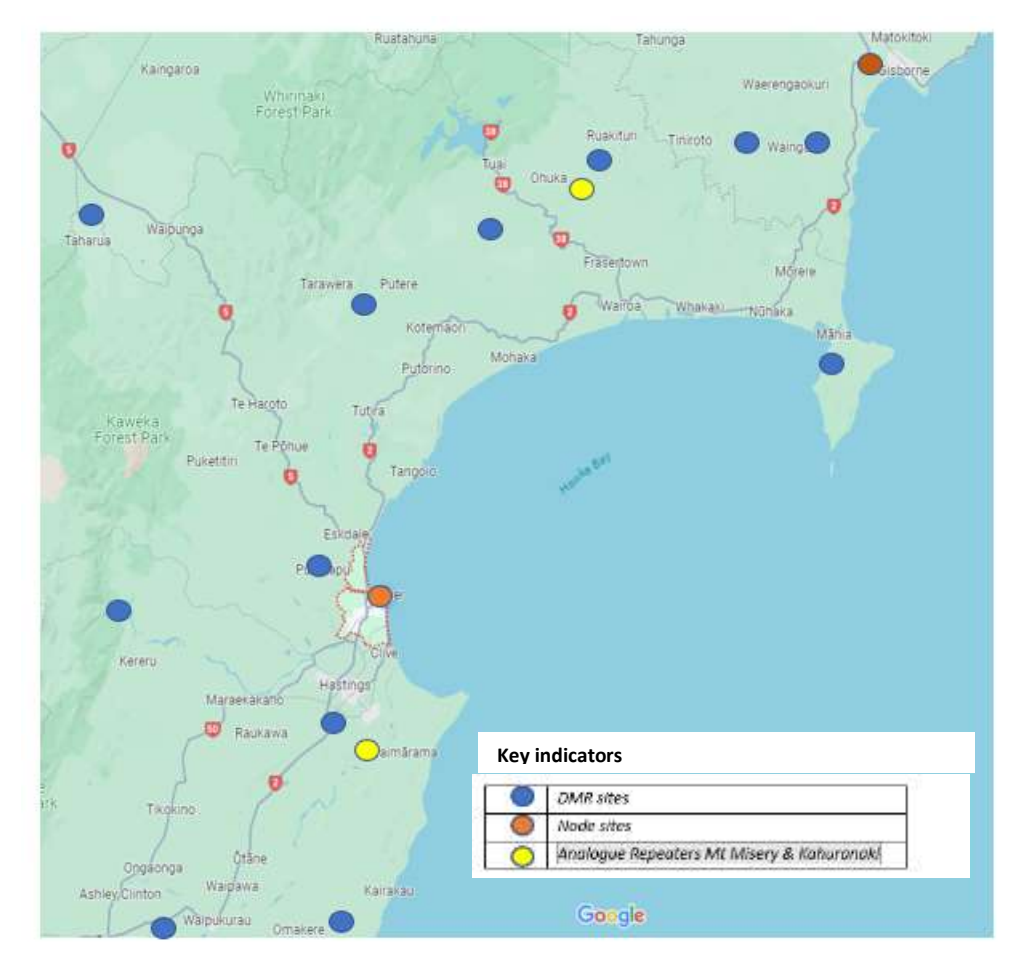
Location Map for DMR, Node and Repeater sites

18. The table below shows the area that the repeater services and the owner and servicer provider of each site. Staff are in the process of formalizing the provision of services with contracts between Council and the service providers which is labelled below as draft in process.