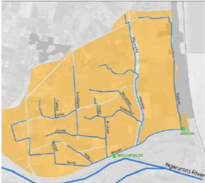
Figure 1b: Brookfields/Awatoto Scheme showing Napier Urban stormwater drainage area with open waterway and pump station locations and names