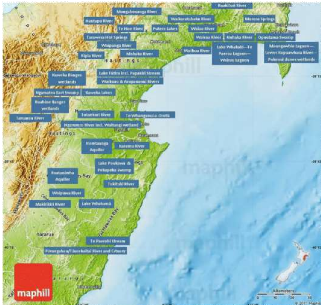
Figure 1: Indicative locations of outstanding water bodies - Proposed Plan Change 7